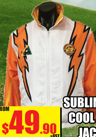
SUBLIMATED & COOL WEAVE JACKETS